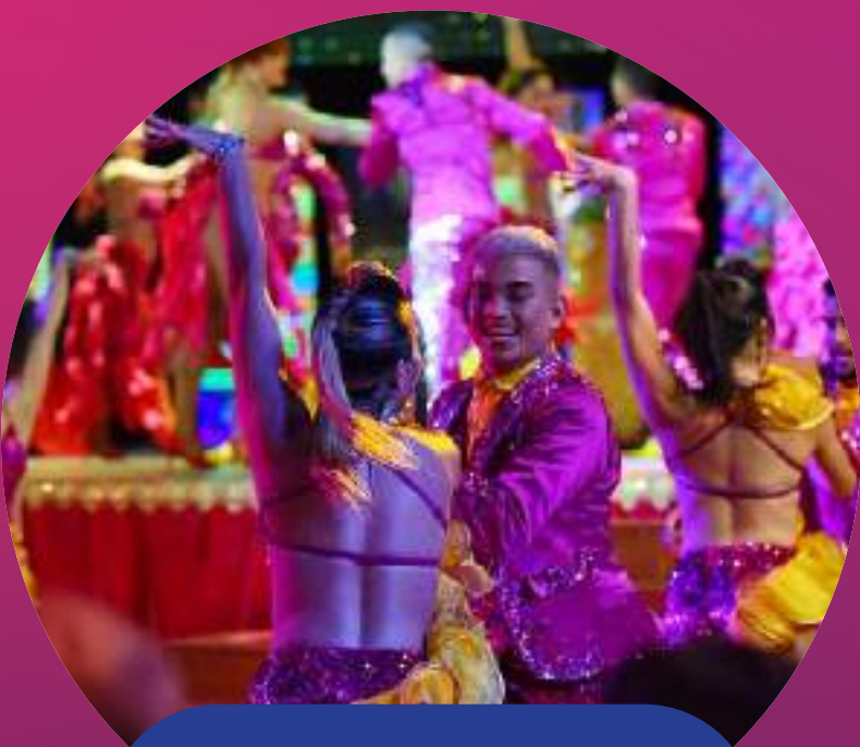
El mulato CABARET

La Topa Tolondra An iconic venue considered the temple of Cali salsa. This nightclub is the epicenter where music lovers, tourists, and salsa enthusiasts gather to enjoy great performances or take salsa classes.