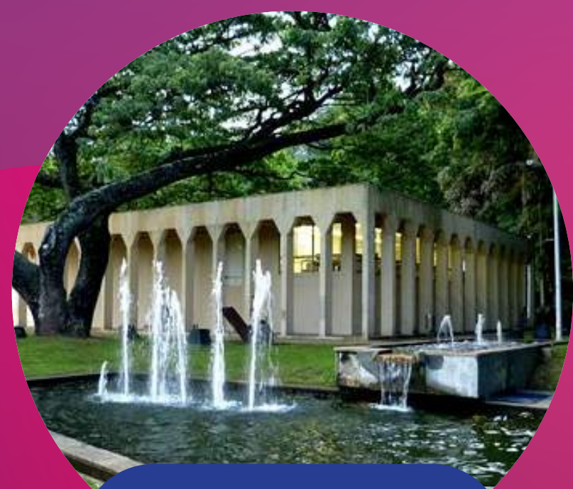
LA TERTULIA Art Museum

The breeze that sweeps down from the Farallones of Cali is the perfect excuse to visit this part of the city, where you'll find a variety of offerings, including classic Cali finger-foo, 'marranitas,' and aborrajados, perfect for a late-afternoon snack.