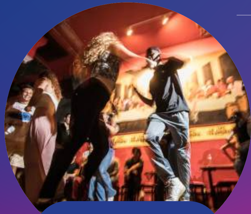
La topa TOLONDRRA

La Pérgola Clandestina, located in the heart of Cali, proudly defines itself as a "100% made in Cali" project. In this bar, which also offers gastronomic delights, urban, tropical, and electronic sounds dominate.