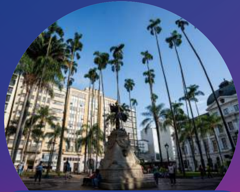
Historic CENTER OF CALI

By the Río Cali, the iconic La Ermita chapel stands tall, an unmissable landmark in the capital of Valle del Cauca.