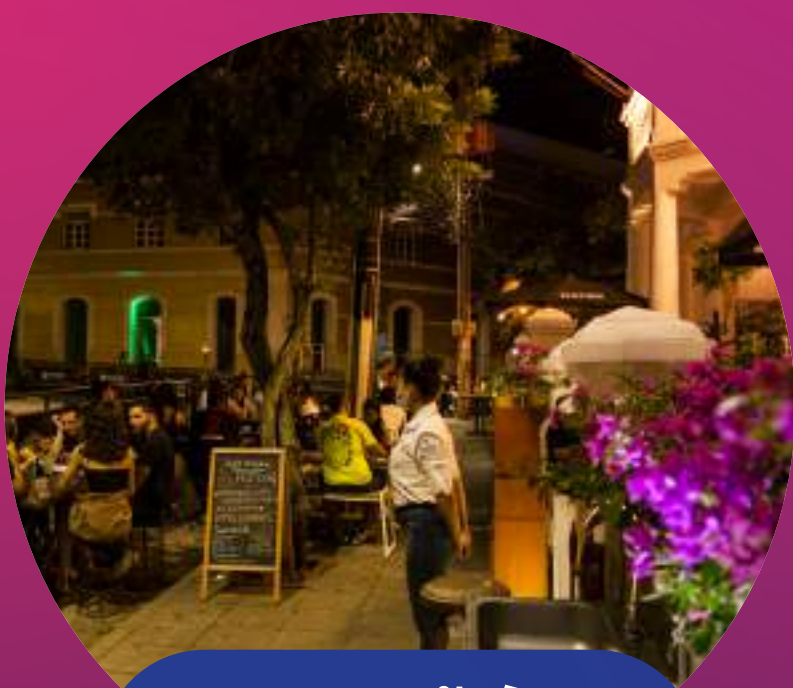
EL PEÑÓN Neighborhood

You'll recognize this square by its flamboyant trumpet, constantly playing the iconic song "Cali Pachanguero," where you can enjoy a tangy mango viche with salt and lemon or indulge in an aphrodisiac chontaduro.