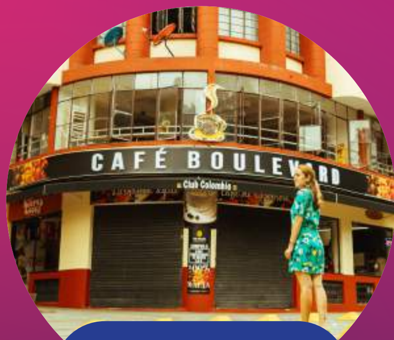
Boulevard DEL RÍO

Explore the historic center of the city, where you'll find beautiful plazas, colonial buildings, and the San Pedro Cathedral. Stroll through Plaza de Caycedo and visit the Palace of Justice and the National Palace.