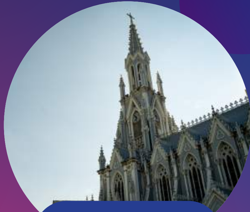
LA ERMITA Church

By the Río Cali, the iconic La Ermita chapel stands tall, an unmissable landmark in the capital of Valle del Cauca.