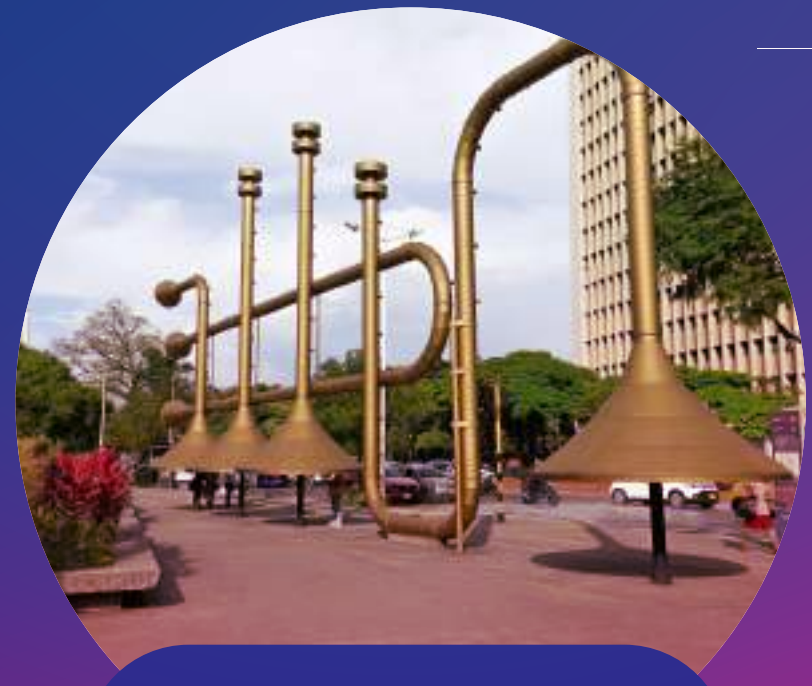
JAIRO VARELA Square

This traditional city area hosts restaurants offering a fusion of our Valluno cuisine and international flavors. Dine at Odiseo, Cantina la 15, Storia D'Amore, or Cuatro Monos for a delightful experience.