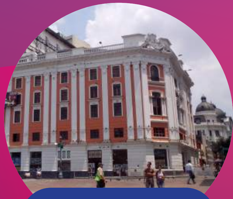
JORGE ISAACS Theater

It's Colombia's first Latin cabaret, with a unique stage and artistic concept led by the salsa company 'Swing Latino,' multiple-time world champions at the World Salsa Festival.