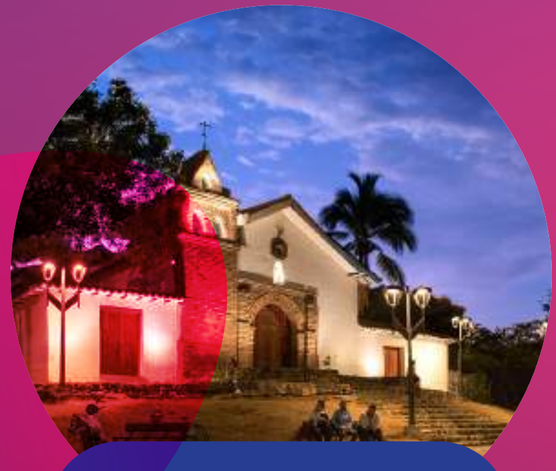
SAN ANTONIO Neighborhood

This neighborhood blends Cali's tradition with a modern world. Enjoy a refreshing lulada or a tropical fruit salpicón at Elsa Café or Mercadillo del Peñón. If you're in the mood for a hearty meal, Citadino, Sonoma, or Faró are great choices.